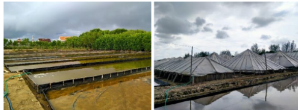
Figure 5. Salt Production with Prism House Technology

The people's salt production method using prism house technology can produce salt production that has the best quality among other production methods because the production process with the prism house is closed so that the production results are clean and very minimally contaminated from the surrounding environment. Based on the results of laboratory testing for the quality of salt produced using prism house technology, the NaCl level was 96.7788%, and the Mg level was 0.080%. Kurniawan et al. (2019) revealed that the quality of salt produced through the prism house method is included in the K1 quality category and can produce quality salt that meets the standards set by SNI. In addition, the production process using prism house technology does not depend on the weather so it can produce salt all year round because, in this prism house, it is in the form of a 2-story stack where the lower floor is a bunker which functions to store young water and the top floor is a production table that functions to the crystallization process. Meanwhile, in terms of the productivity of the prism house method, it can reach 240-260 tons. The prism house method's weakness is that it requires additional costs to make prisms, and the level of difficulty in prism construction is quite difficult, so special expertise is needed to make this prism house. The technology for salt production using a prism house can be seen as follows: