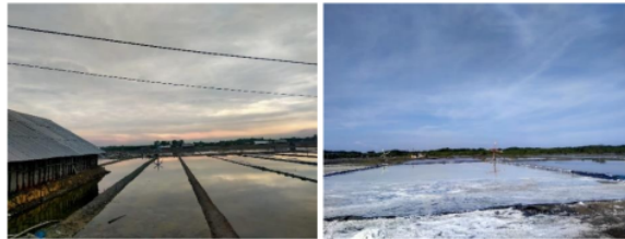
Figure 4. Salt Production with Geomembrane Technology

crystallization table, where in this geomembrane method, the crystallization table is coated with geomembrane plastic. Using a geomembrane on a salt crystallization table can speed up production time, reduce work, and produce more white and white salt. Based on the results of laboratory tests related to the quality of salt produced with geomembrane technology, it was found that NaCl levels were between 77.3735% and 95.3152%, and Mg levels were between 0.081% and 0.102%. In terms of quantity, salt production using geomembranes can increase the amount of salt production by 2 times compared to traditional methods, namely as much as 80-120 tons/hectare/season. This is in line with what was disclosed by Muliana et al. (2022) that the geomembrane method has several advantages in operation, such as producing large quantities of salt, speeding up the salt crystallization process, and easing the work of salt farmers. Even so, this method still has drawbacks. Namely, the production process still relies on weather/sunlight, so production activities only occur during the dry season. Salt farmers are not uncommon to harvest prematurely, ultimately affecting the quality of the salt produced. In addition, additional costs must be incurred to purchase geomembrane plastic. The technology for producing salt using geomembrane on a crystal table which salt farmers widely use, can be seen in the following figure: