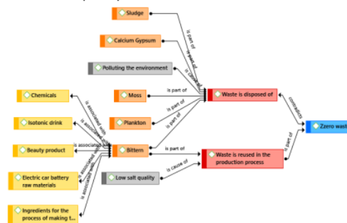
Figure 1. Results of Zero Waste Principle Analysis

Dirt and waste generated from the people's salt production process in East Java Province include plankton, sludge, calcium gypsum, and bittern. Based on the research data that has been done, the results of qualitative research data analysis with the help of Atlas.ti 9 software related to the principle of zero waste can be seen as follows: