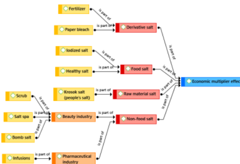
Figure 7. Results of Economic Multiplier Effect Principles Analysis

The form of economic multiplier effect in the salt sector in East Java Province can be seen from the various kinds of salt produced apart from krosok salt, which is the main product. Based on the research data that has been done, the results of qualitative research data analysis with the help of Atlas.ti 9 software related to the principle of the economic multiplier effect can be seen as follows: