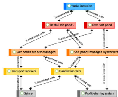
Figure 2. Results of Social Inclusion Principles Analysis

The form of social inclusion in the salt sector in East Java Province can be seen in the management system working on people's salt ponds. Based on the research data that has been done, the results of qualitative research data analysis with the help of Atlas.ti 9 software related to the principle of social inclusion can be seen as follows: