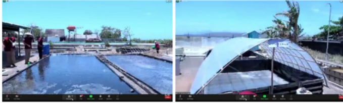
Figure 6. Salt Production with Valve System Technology