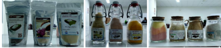
Figure 8. Processed Products of People's Salt

In East Java Province itself, the people's processed salt products produced by salt farmers are in the form of iodized consumption salt and spa salt. This is only limited to groups of salt farmers who have formed cooperatives and are advanced. However, academics, students, and lecturers from the Maritime Studies Program at Universitas Trunojoyo Madura are developing many innovations in processed salt products. The development of processed salt products is expected to empower the community and increase the selling price of the salt itself. The results of salt processing innovations produced by students of the Marine Science Study Program can be seen as follows: